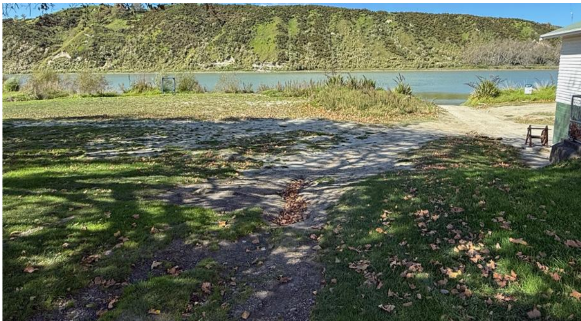
SOUTHERN VIEW OF YACHT CLUB RESERVE

The consequence of this change has seen the basement of the Yacht club building flooding in low intensity rainfall events (100mm) creating a regular maintenance issue for the club as well as impacting on the insurance policy for the building.