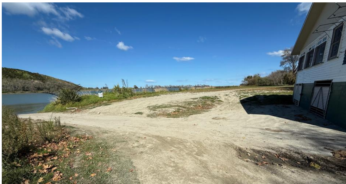
NORTHERN VIEW OF SILT BUILDUP AROUND YACHT CLUB BUILDING AND LANDING

It is expected that if the project is agreed with stakeholders, it would be completed in the April/May 2025 period.