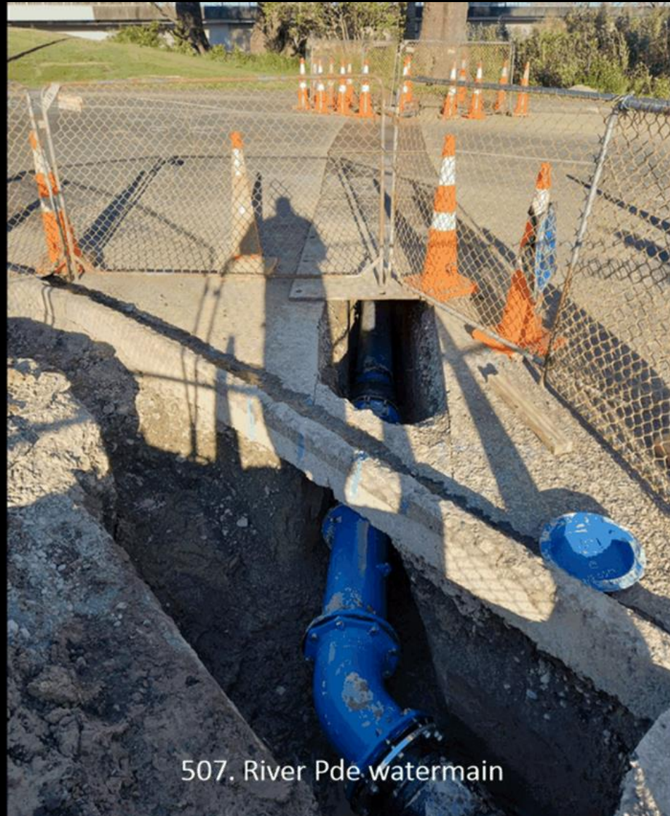
507. River Pde watermain