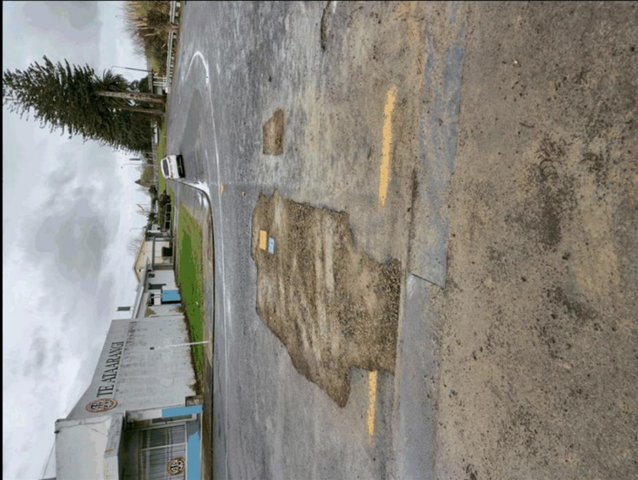
508. River Pde water main following backfill