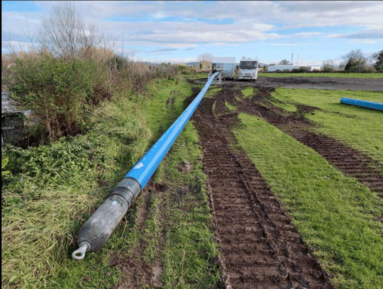
501. River Pde watermain