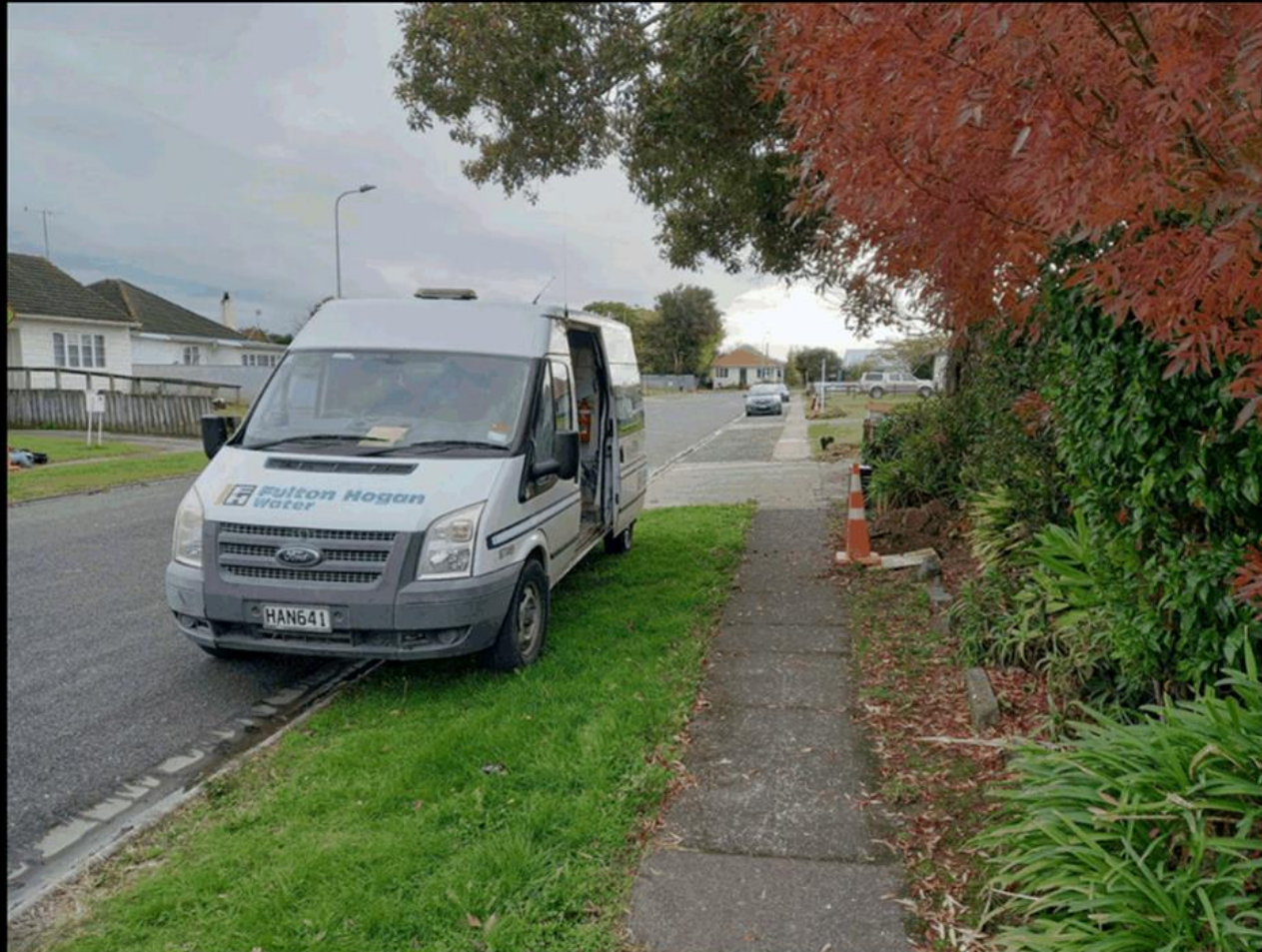
1900. Toby replacements 1