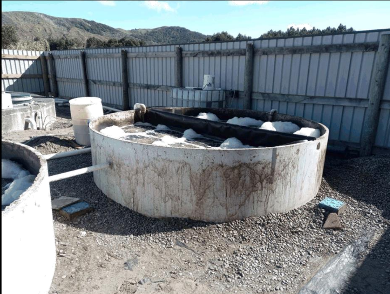
604. Opoutama temp WWTP at 3weeks