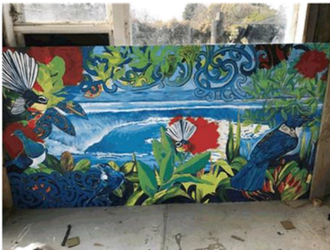
Figure 2 Concept 1