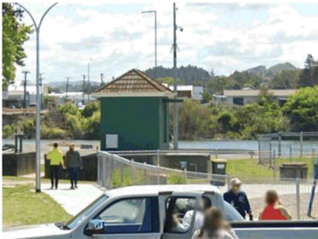
Figure 1 Alexander Park PS