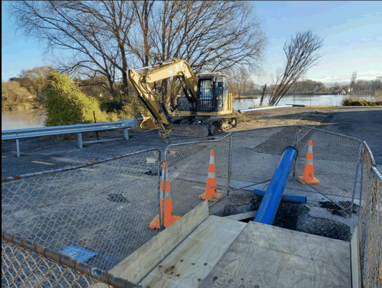
505. River Pde watermain