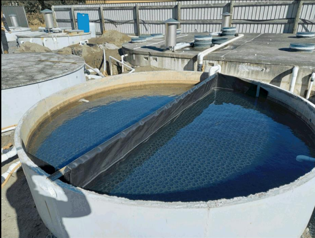
603. Opoutama temp WWTP at commissioning