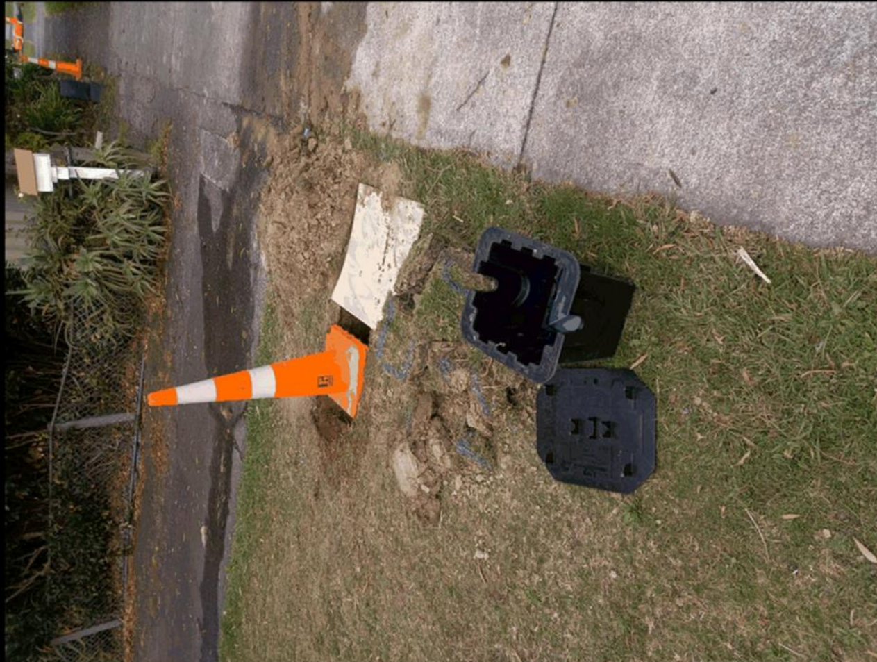
1902. Toby replacements 2