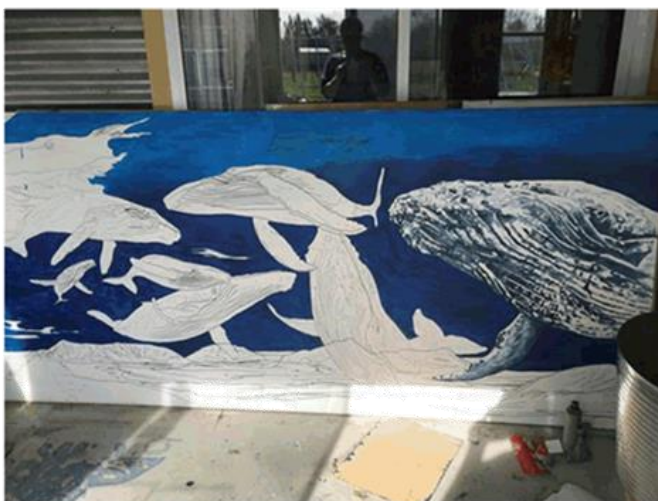
Figure 3 Concept 2