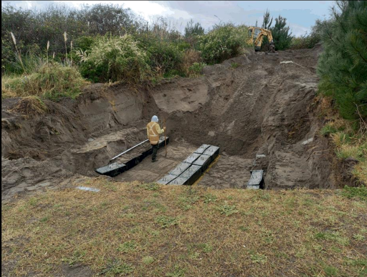
606. Opoutama - Self contained vehicle waste station tanks - digging hole