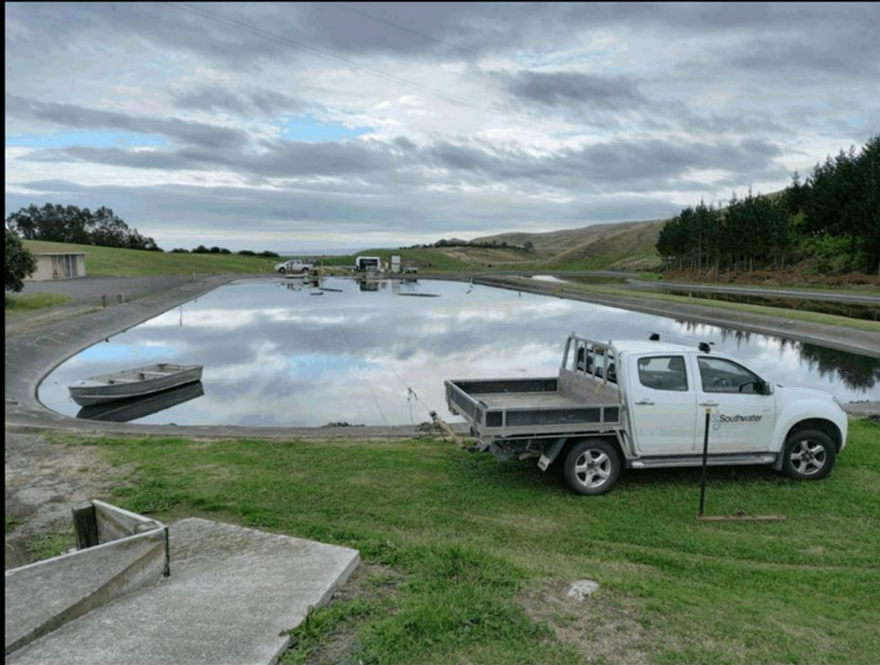
1804. Wairoa WWTP - Southwater desludging2