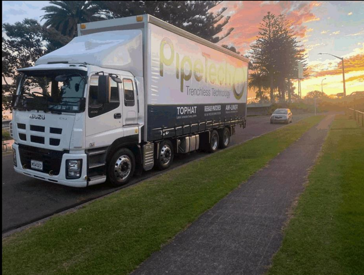
1701. PipeTech 2