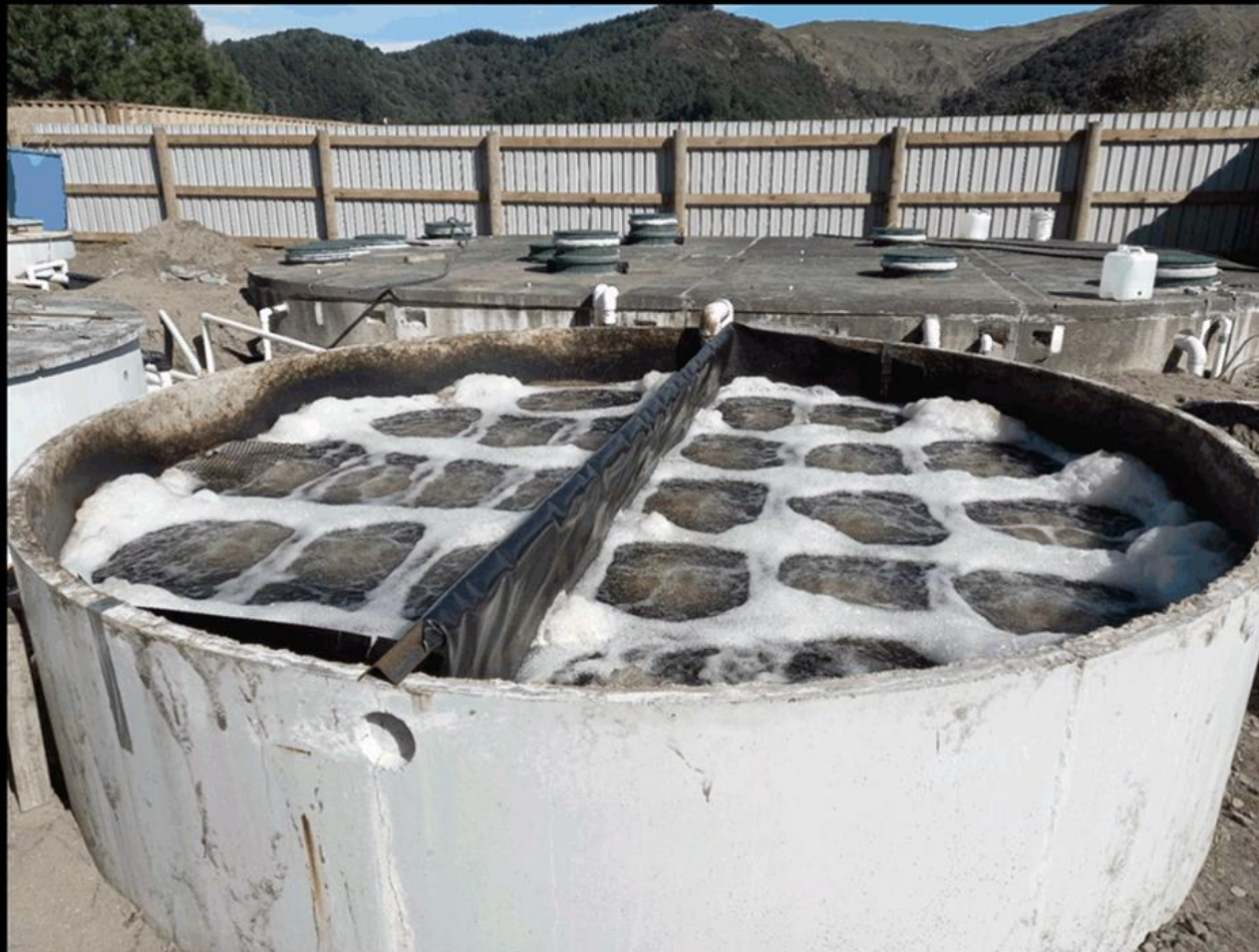
605. Opoutama temp WWTP at 3weeks (2)