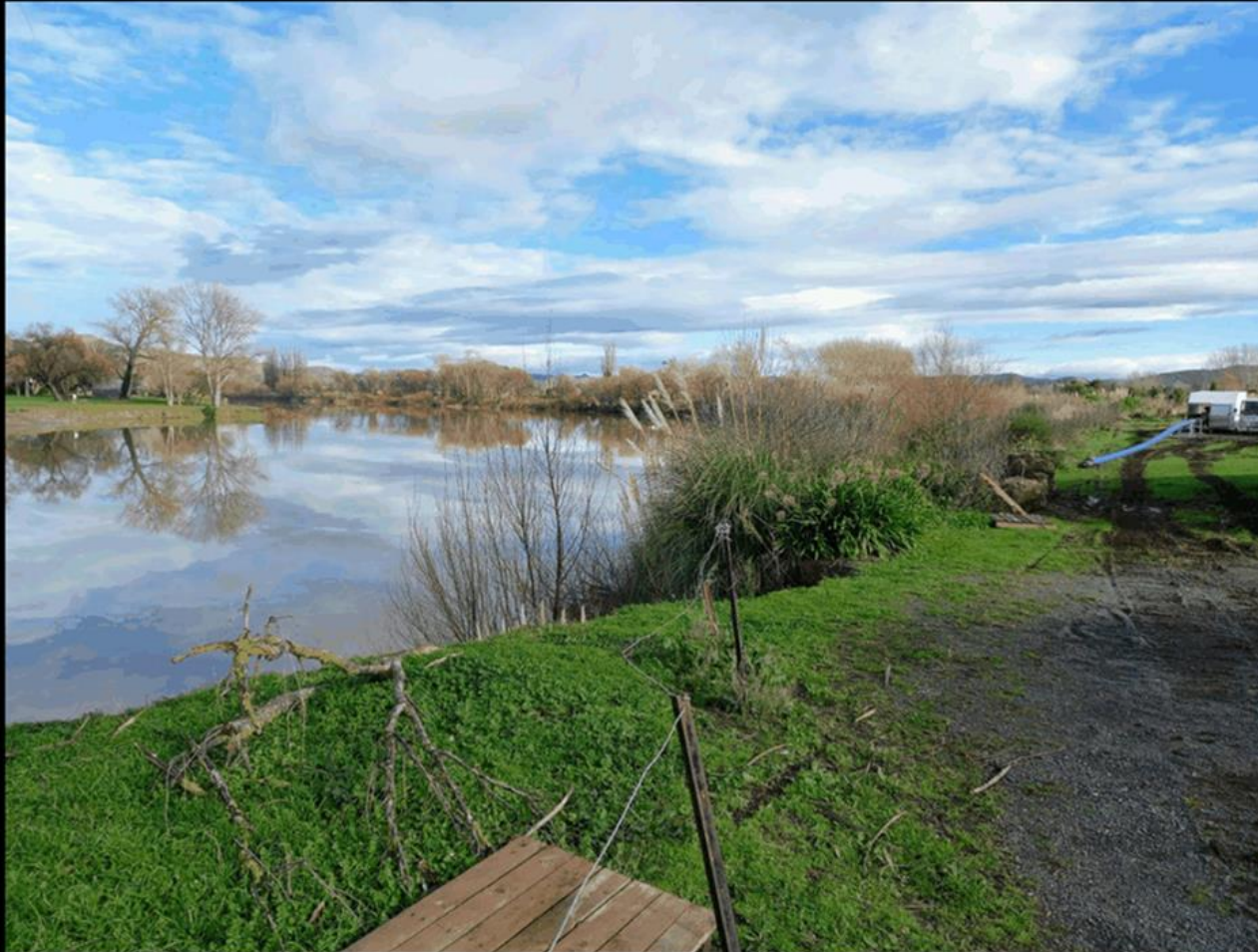
502. River Pde watermain