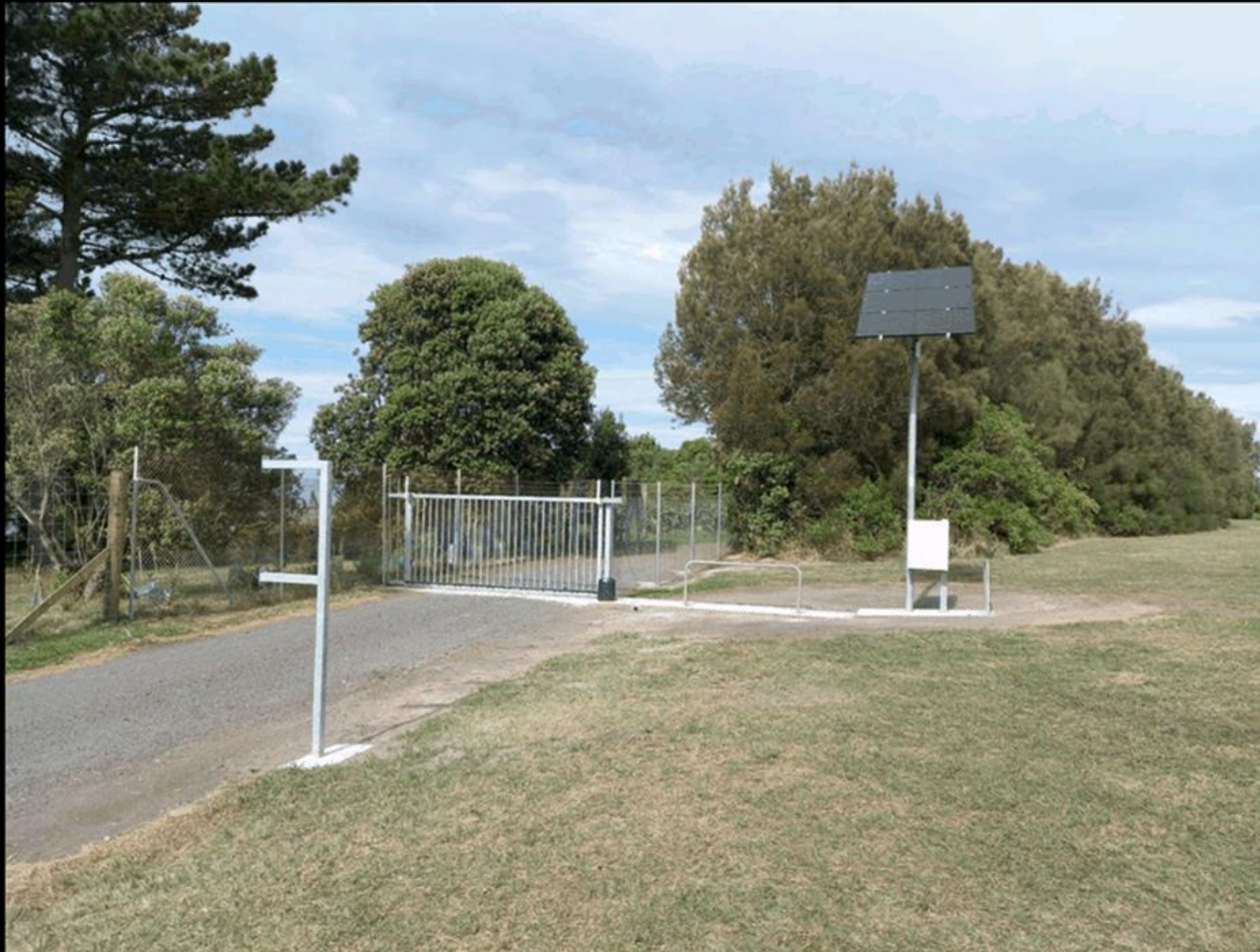
1800. Wairoa WWTP - Gate