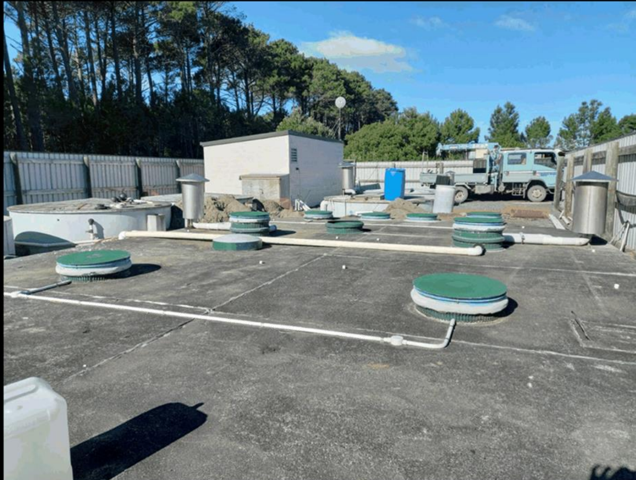
601. Opoutama temporary plant