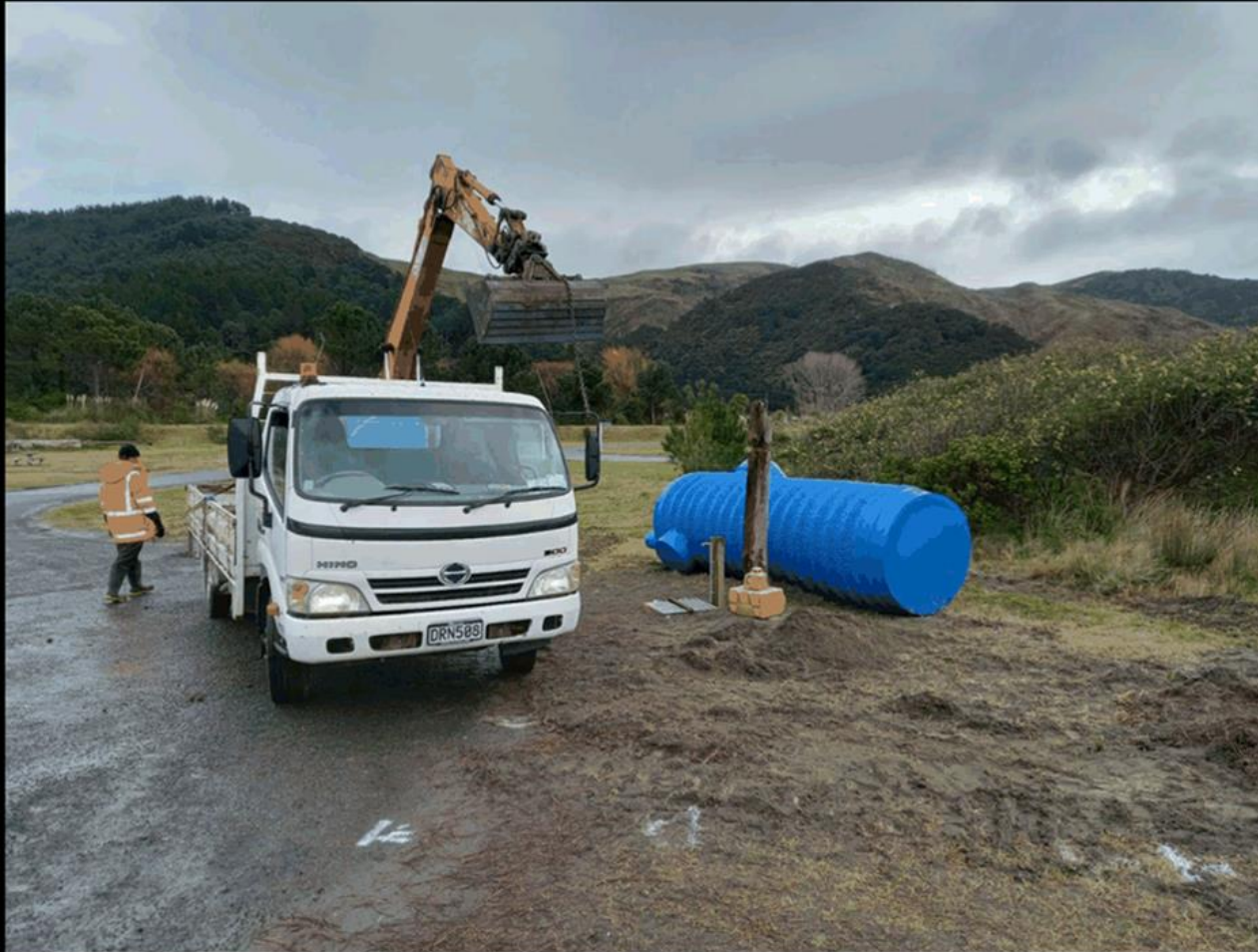
607. Opoutama - Self contained vehicle waste station tanks prior to install