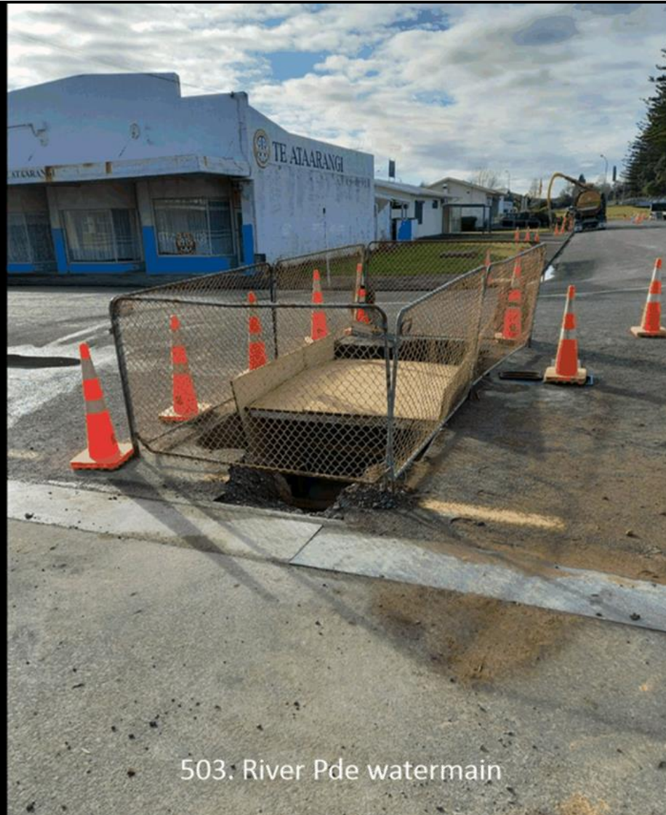
503. River Pde watermain