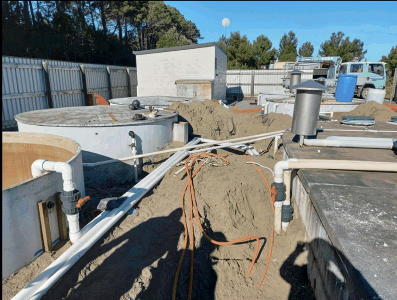
602. Opoutama temporary plant