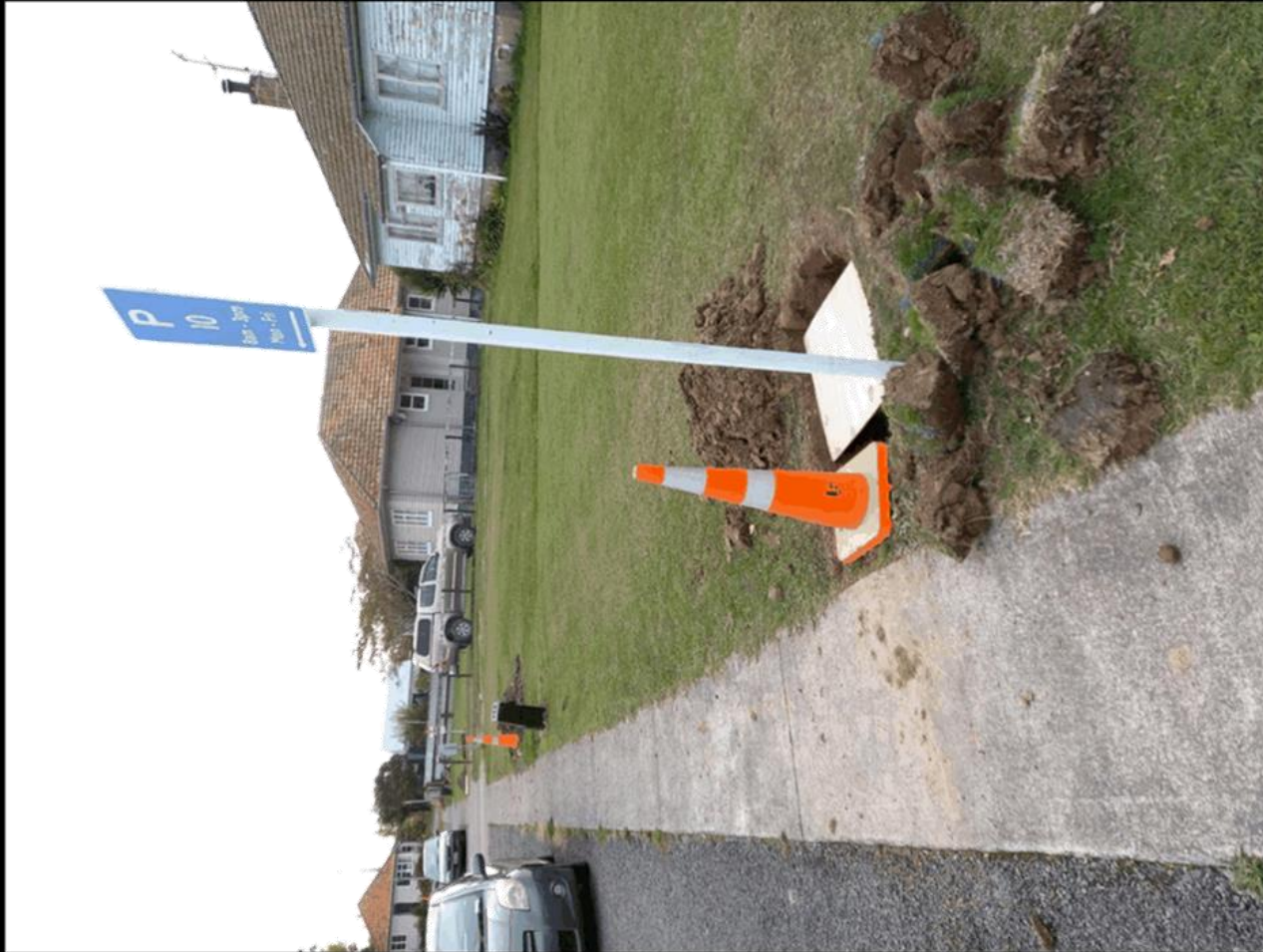
1903. Toby replacements 3