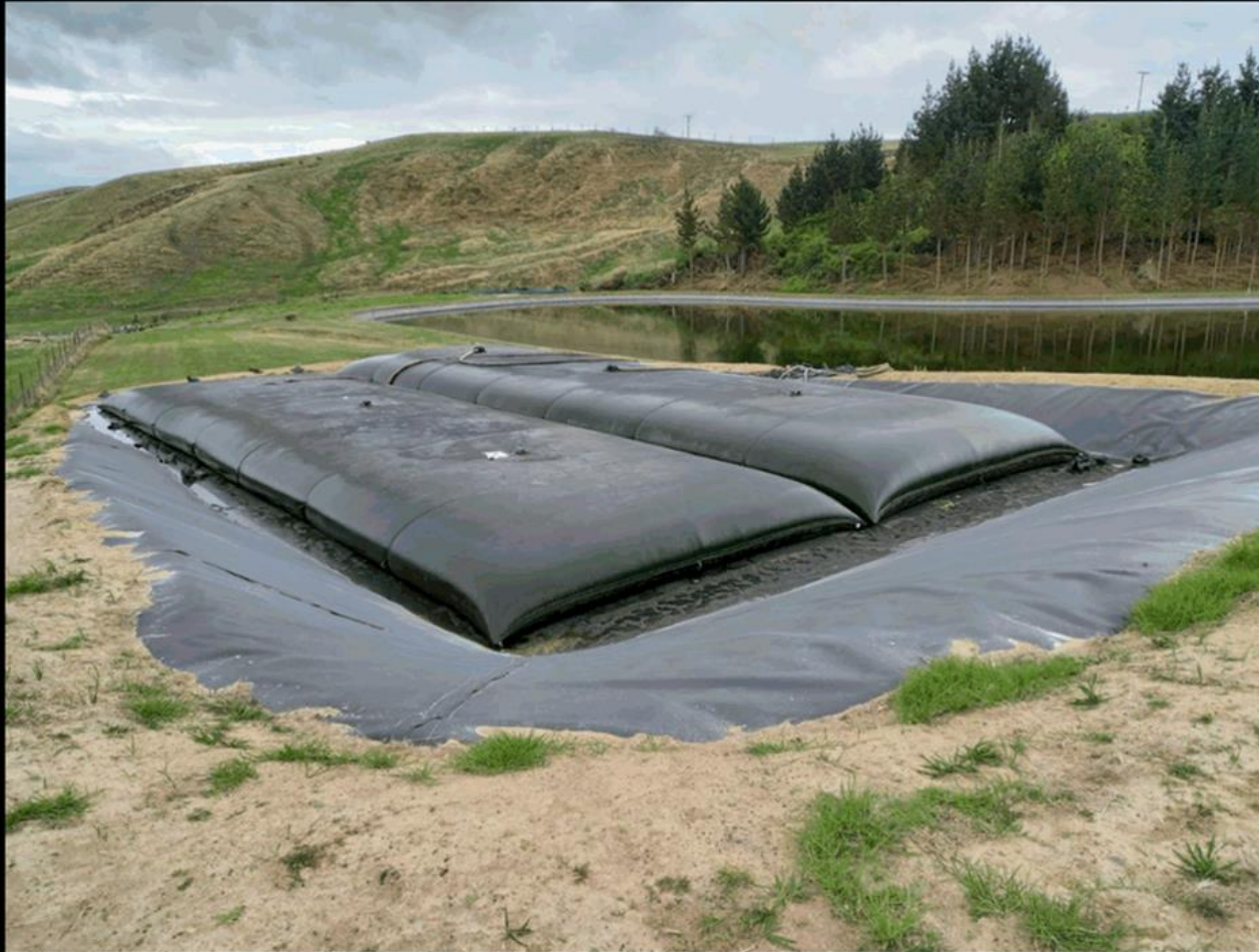
1802. Wairoa WWTP - geobag full